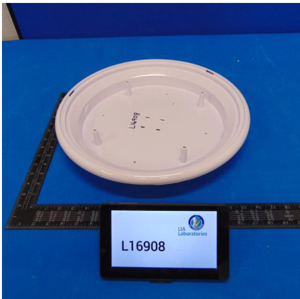
Figure 2. Product image